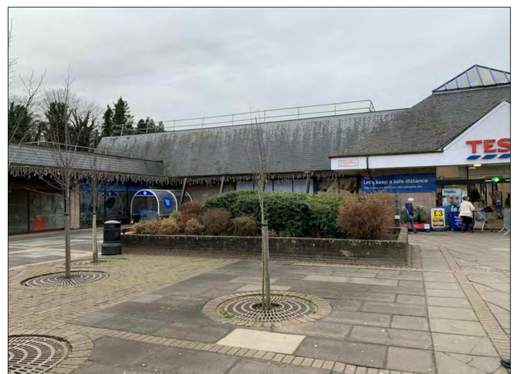
Number 27 (raised planter behind) - Type A - New Rowan Tree ( Sorbus acuparis 'Joseph Rock') proposed into soft landscape