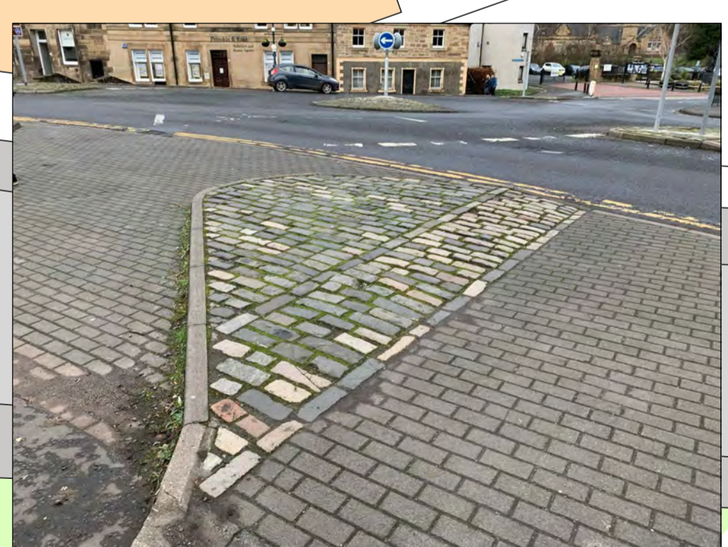
Number 23 - Type C - New Fastigate Hornbeam Tree ( Carpinus betulus 'Frans Fontaine') proposed into new tree pit