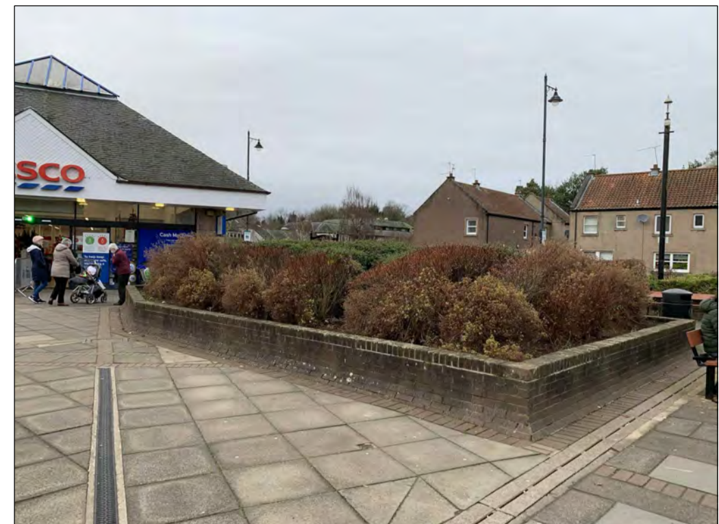
Number 24 & 25 - Type A - New Rowan Trees ( Sorbus acuparis 'Joseph Rock') proposed into soft landscape.