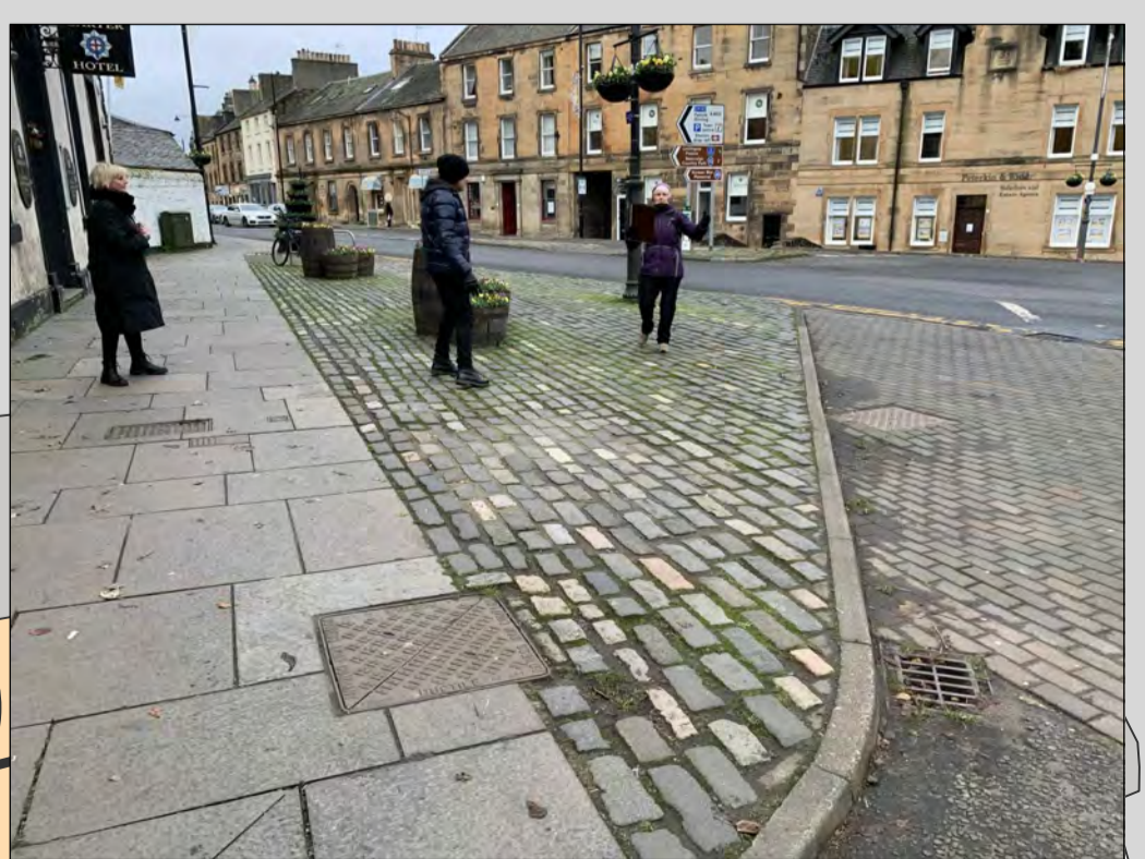
Number 22 - Type C - New Fastigate Hornbeam Tree ( Carpinus betulus 'Frans Fontaine') proposed into new tree pit